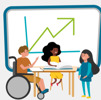
Hybrid learners in 2020–21